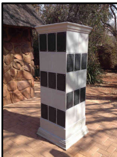
NG Pierre van Ryneveld